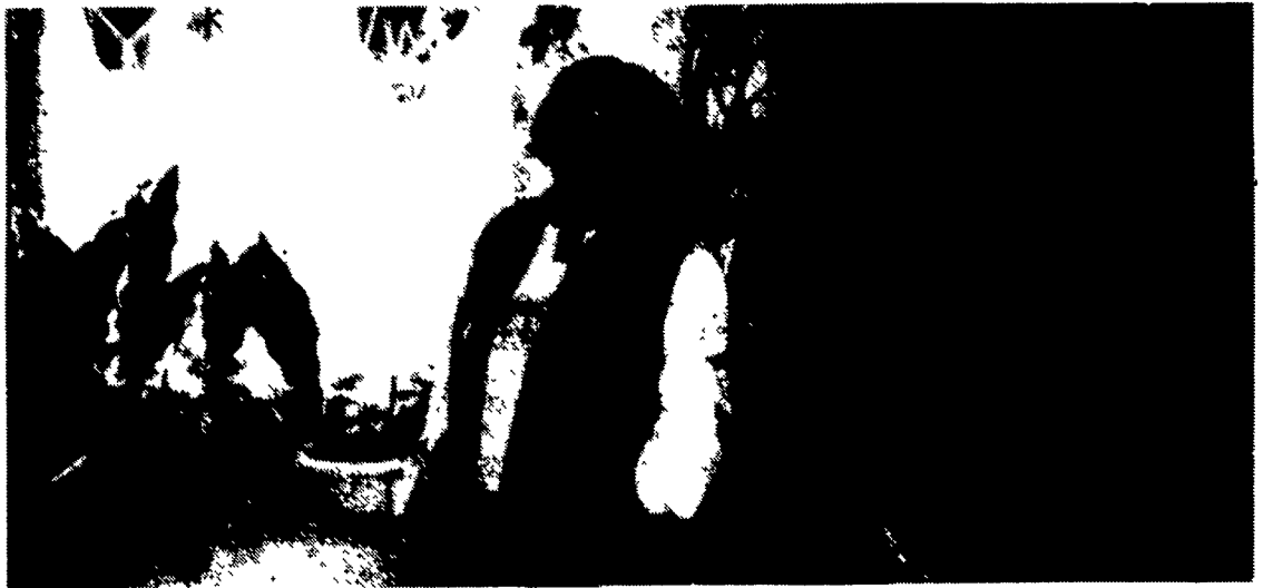
The front room is ablaze with plants in Carrie's home.