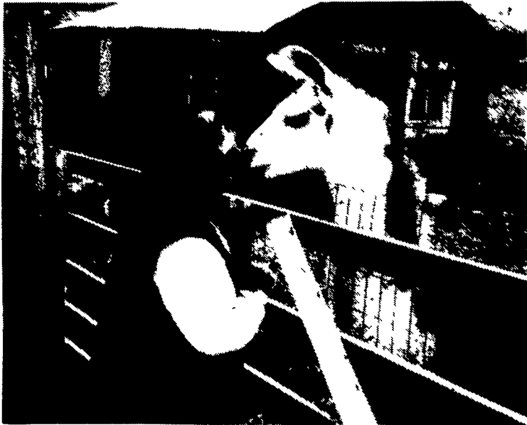
Willie the llama is a favorite on the Beckley farm.