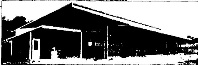
OPEN-SIDED HEIFER FACILITY