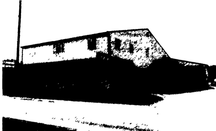
Here you can see the before (left) and after scenes of the dealership's facilities in the town of Quarryville.

received their first Case tractors in 1932. The New Idea line was taken on in the 1930s and the Gehl line in 1972. These are still the major lines of equipment sold at the dealership, along with Bush Hog, Cub Cadet, Ingersoll, SCAG, and Echo.