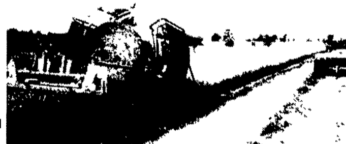
Tube-Line wrappers for all round bales or large square bales are available in either manual or fully automatic models.

Long stem silage is better used in the animals digestive system. Feeding high quality haylage from wrapped bales can reduce or eliminate feeding grain while retaining or increasing weight gains or milk production.