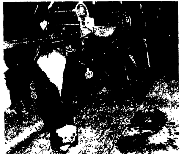
These cows enjoy Purina feeds at Abe-Mar farm.