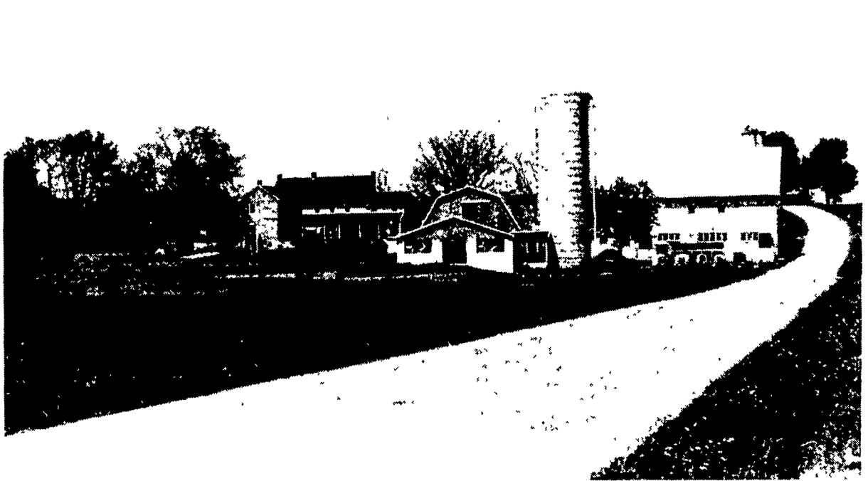
Here's a view of King Ridge farm.

Up the road at King Ridge Farm 56 homebred Registered Holsteins have a rolling herd average of 24,468m. That's up 2,313 pounds from the June ad report. Their latest daily herd average is 85.3 pounds. The feeding ration is built around flake feed and Super EXT topdress. King Ridge is a long time customer and says Purina feeds perform well. "Cows keep good body