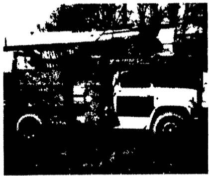
Material Handler Bucket Truck - 42 Bucket with Jib 1981 and 1982 Diesel Engine - Auto or Stick - Special $9,995