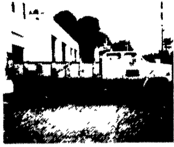
1986 Chevy 5 Man Cab Dump, 3208 Cat - 5/2, Air Brakes Dump with Lift Gate. Dump 14' Long, GVW 34,000 pounds