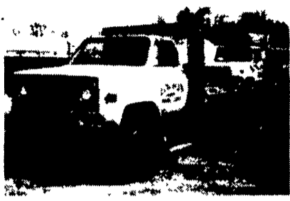
Flat Bed - Diesel 8.2 - 5 speed auto with 2 speed rear GVW - 26,000