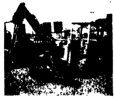
Vermeer M-470 Trencher with backhoe. This is one of six units we have all ready to work. Starting at $4,500.

Huntingdon Valley, PA • 215-672-9667 • 1-800-543-3833 • Eddie