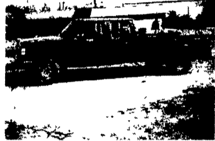
One of Two - 1987 Ford F-350, 460 Eng, 4 spd, great for pulling trailers

DIGGER DERRICKS/AERIAL BUCKETS/UTILITY EQUIPMENT