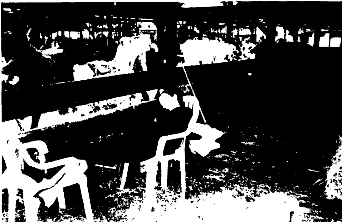
Asleep after a long day at the Fair.