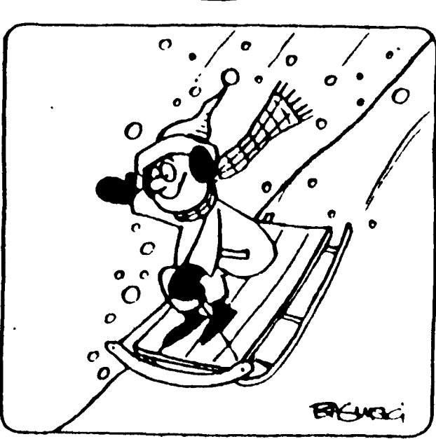
A little money buys a lot of Action. USE CLASSIFIED ADS