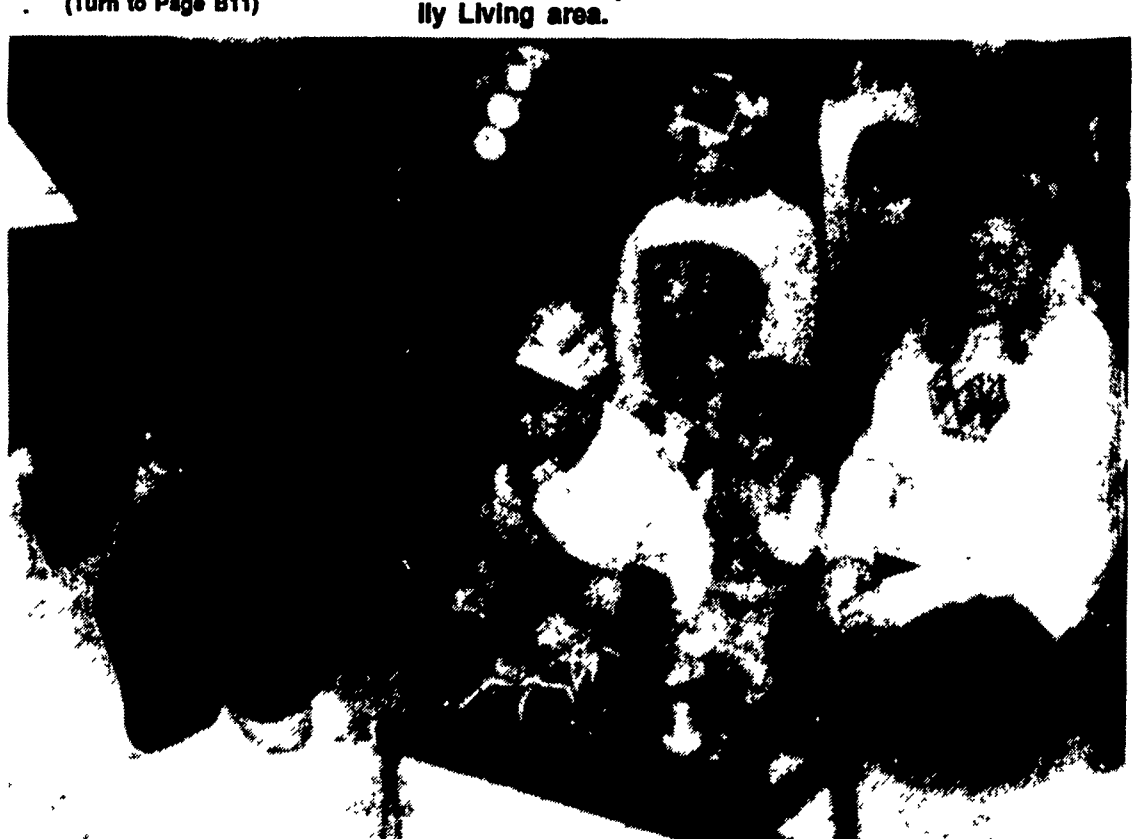
Hands on learning is available at the Farm Show.