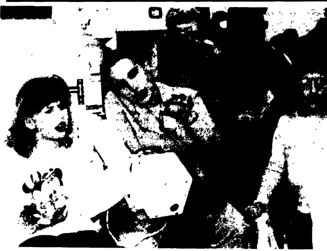
Popular with kids of all ages is the NASA simulator, which gave visitors a taste of life in orbit.