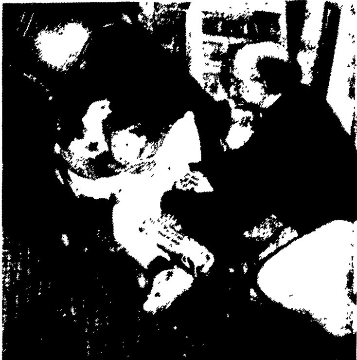
A tunnel slide provides entertainment for kids in the Family Living area.