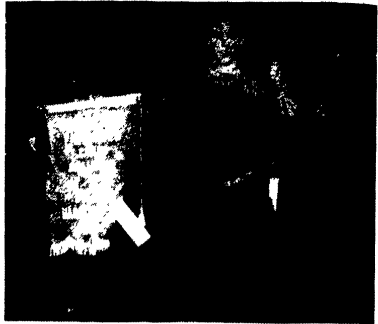
Tim Kosiorek has the grand champion market steer.