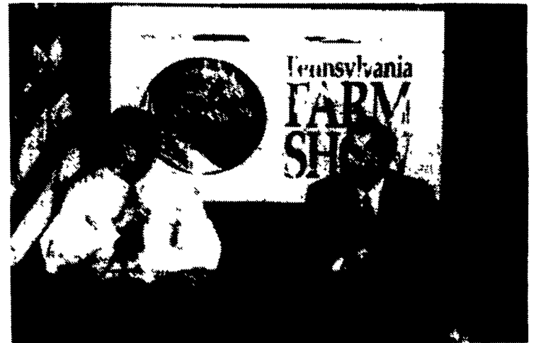
Gov. Ridge and Sec. Hayes answer questions at a news conference.