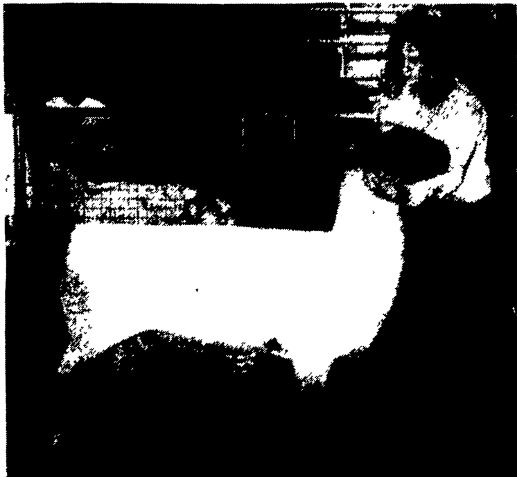
The state Farm Show champion Hampshire ram is shown by Stacy Suffel.