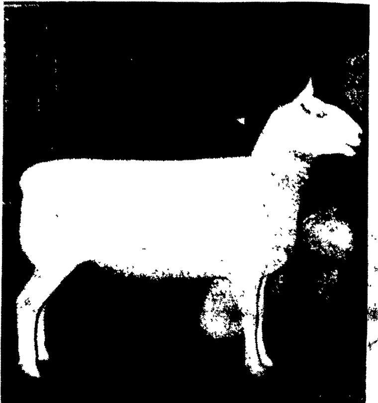
Erdenheim Farm shows the champion Cheviot ewe.