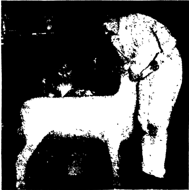
The state Farm Show champion Southdown ewe is owned by Jamie Fought.