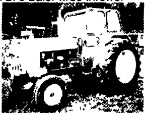
Ford 5000 Tractor w/cab 1970 Diesel Front Bumper