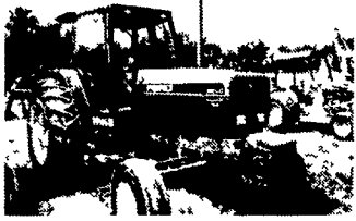
Ford 8240 Cab Tractor , Real Sharp, SLE, Power Shift, 96 HP

50 North Greenmont Road, Rising Sun, MD 21911 410-658-5568 800-442-5043