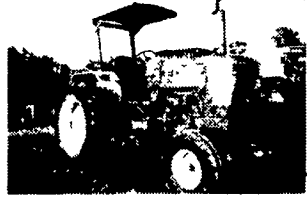
Ford 7710 II Tractor , 86 HP, Dual Power, 2 Remotes