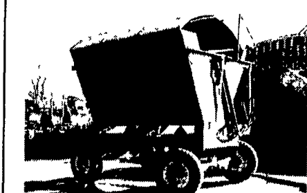
Used John Deere Side Dump FORAGE BOX Field Ready- New Paint