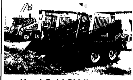
Used Gehl Skidloaders 4610, 44 HP Diesel, 65" Bucket, New Tires, New Paint 4510 40HP Gas, 65" Bucket