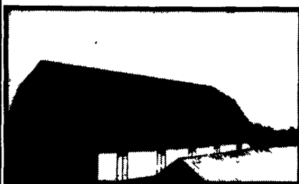
Use on Barns Or Garages