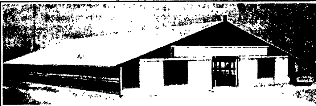
Concrete Slatted Free Stall Barn