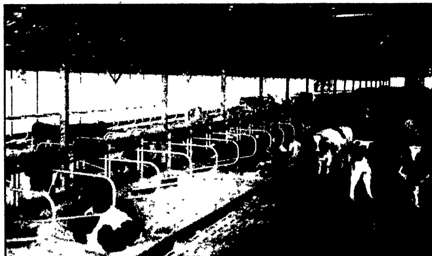
Long Core Cattle Waffle Slats