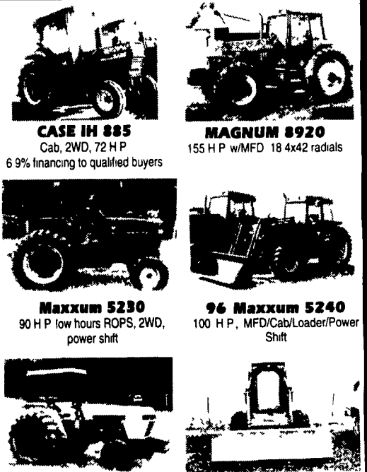
CASE IH 885 Cab, 2WD, 72 H P 6.9% financing to qualified buyers MAGNUM 8920 155 H P w/MFD 18 4x42 radials Maxxum 5230 90 H P low hours ROPS, 2WD, power shift 96 Maxxum 5240 100 H P, MFD/Cab/Loader/Power Shift CASE 1394 65 H P 12 speed synchromesh Good condition 6.9% financing to qualified buyers CASE 1845C Unloader only 2000 hours cab w/heater, new tires (snow plow optional)