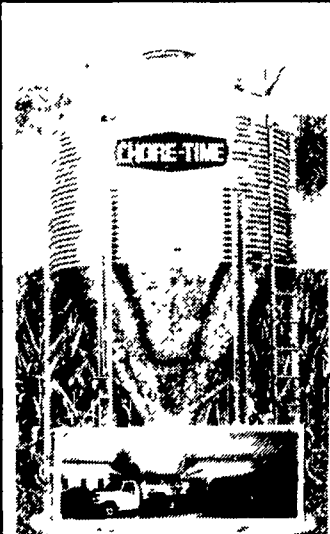
Call for pricing on bins assembled and delivered to your farm