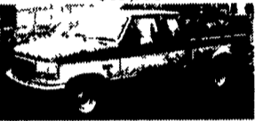
96 FORD F150 XLT EXTEND CAB V8, AT, Most Options, 16,000 Miles