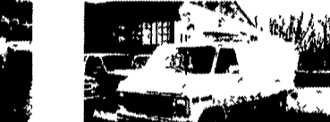
86 CHEV C30 VAN w/ELECTRIC 27ft. BUCKET 6.2 Diesel, AT, PS, PB, Fresh white Paint, Ex Cond. Ready for Service