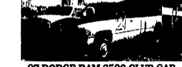
97 DODGE RAM 3500 CLUB CAB DUALY 4X4 Cummins Turbo Diesel, AT, AC, PW, PL, SLT Pkg., 410 LS, 1,000 Miles, Black/Pewter, Full Fact. Warranty, #D226