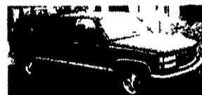
95 GMC 1500 SLE EXTEND CAB V8, 5-Spd., Most Options, Maroon, 38,000 Miles

SPECIALIZING IN TRUCKS & VANS 1200 North Reading Rd., (Rt. 272) Stevens, (Lancaster Co) PA 17578 717-336-3130