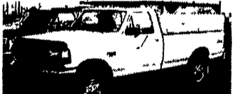
94 FORD F350 4x4 Turbo Diesel, 5-Spd., XL Trim PS, PB, AM/FM, Side Tool Boxes & Ladder Rack, 9,000 GVW, 69,000 Miles, White #F683