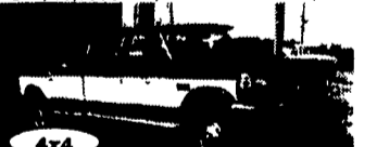
93 FORD F350 CREW CAB DUALY 4X4 Centurion Conversion Pkg, 460 V8, 5 Spd XLT Loaded, Rear Fold Down Bed, Alum Wheels, Only 48,000 Miles #F658