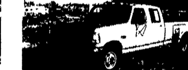
95 FORD F350 CREW CAB DUALY Power Stroke Diesel, 5 Spd., AC, AM/FM, Bedliner, Class III Hitch, Dual Tanks, 64,000 Miles, Charcoal Grey, #F687