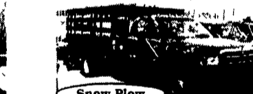
94 DODGE RAM 3500 12 FT. STAKE BODY Power Angle Plow, Cummins Turbo Diesel, AT, A/C, PS, PB, AM/FM, 26,000 Miles, 11,000 GVW Red #D223