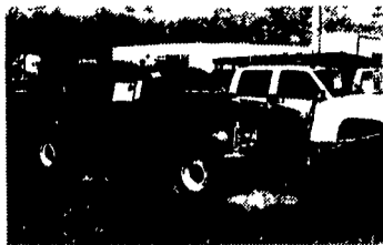
'98 CHEVY K2500 w/Western 8 1/2" V-Power Angle Plow, 350 V8, AT, AC