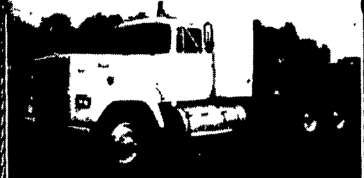
1985 Mack Super Liner 350 Cummins, 10-Spd. Trans., Good Rubber, New Brakes, AC $12,500 717-529-2512 No Sunday Calls