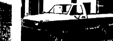
88 FORD F250 4x4 460 V8, AT, PS, PB, 8600 GVW, 58,000 miles, 2-Tone Blue/White #F669