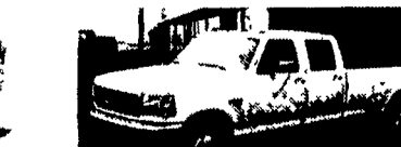
96 FORD F350 CREW CAB DUALY Power Stroke Diesel, XLT, AT, A/C 32,000 Miles, White, #F659