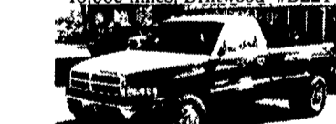
95 DODGE 3500 DUALY Cummins Turbo Diesel, AT, A/C, PW, PL, C, T. 44,000 Miles Blue & White #D218