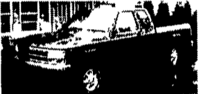
95 DODGE DAKOTA, EXTEND CAB SLT 4x4, V8, AT, A/C, 34,000 Miles, Maroon