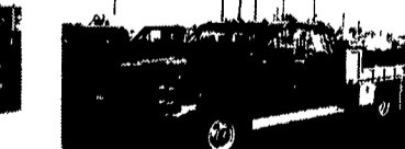
89 GMC K3500 CREW CAB DUALY 4X4 8 ft. Eby Alum, Flatted w/Gooseneck Hitch 454 EFi PS PB, 11,000 GVW, Hi-miles, Looks & Runs Good #G184