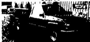
96 CHEV. 3500 Utility V8, AT, DK Blue, 12,000 Miles