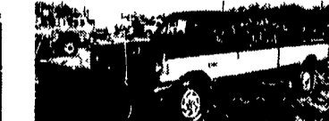
89 FORD F250 SUPER CAB 4X4 7.3 Diesel, Power Angle Plow, XLT, AT, AC PW, PL, 81,000 Miles, 2-Tone Blue, #F686