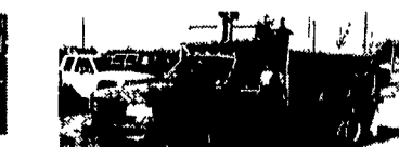
94 FORD F350 CONTRACTOR DUMP 460 V8, XL Trim, AT, 37,000 Miles, Red, #F682