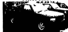
96 DODGE DAKOTA SPORT 4 Cyl., 5 Spd., 12,000 Miles, Black $8,995