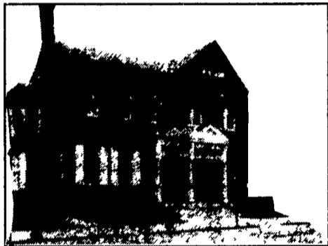
ENB has been a part of Ephrata since 1881. This building at 110 East Main Street was the Bank's home from 1884 until 1925.