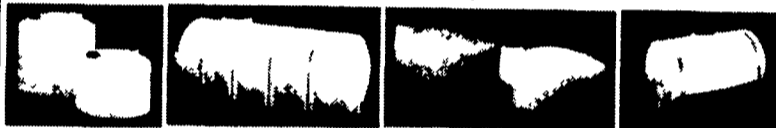
Mini Bulk Tanks Horizontal Leg Tanks Pickup Truck Tanks Applicator Tanks