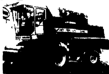
1990 MF 8460 Combine with Hillside Cleaning, 20 Ft Floating and 6 Row Corn Head, 2189 Hrs $67,000