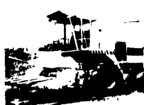
NH 2100, SN#404504, 1984 4 RN Cornhead, 10' Hay Head, 4WD, 2500 Hrs, Like New, Rubber Excellent, One Owner $59,000