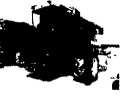
IH 1480 Combine 2WD (#12923) $19,000