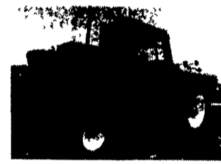
CIH 3688 3385 Hrs., 3 Pt. Click Hitch (#13811) $20,000