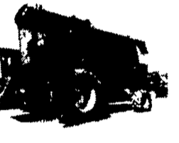
CIH 1660 Combine 2WD, 2156 Hrs. (#13434) $64,000