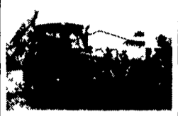
CASE 880L GET A GOOD DEAL ON THE LEADER 4WD, CAB, EXTENDED HOE, REASONABLY PRICED