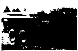
NEW IDEA SIDENICK 2200 gallon - semi solid spreader Demo rental unit Has 3 Year Warranty Fall Blowout Price $9,900