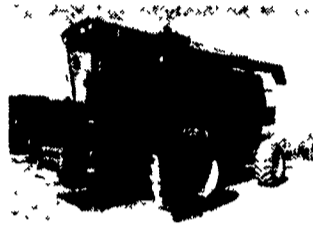
'90 Case IH 1680 Combine 4WD 2335 hrs. (#13907) $74,000