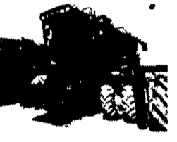
CIH 1680 Combine Dual, 2841 Hrs. (#13922) $81,500