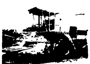
NH 2100, SN#404504, 1984, 4 RN Cornhead, 10' Hay Head, 4WD, 2500 Hrs, Like New, Rubber Excellent, One Owner $59,000