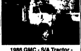
1986 GMC - S/A Tractor - 300 HP Diesel - 10 spd. - 32,000 GVW - Inspected