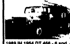
1989 IH 1954 DT 466 - 6 spd. - 33,000 GVW - 150" C to A - A/B - 95,000 miles - Very Clean.