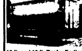
16 ft. and 18 ft. Reefer Bodies - Working Condition $950.00 Also Lift Gates $350.00