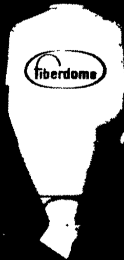
(2 - 10 Ton)

Capacities from 2.5 ton to 30 ton. (Tonnage based upon 40 lb. density) Industrial Bins Available