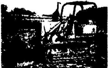
JD 555 Crawler Loader w/Ripper, Good U/C, Rebuilt Trans. ....$14,000

Leave a message We'll get back to you within 24 hrs