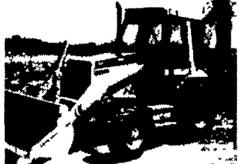
1993 Cat 416B 4x4, Ext-A-Hoe, EROPS, New Rubber ..... $39,500