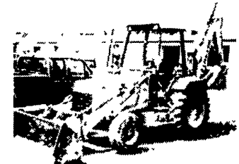
'93 Ford 555D TLB 2500 hrs., good rubber ..... $24,500