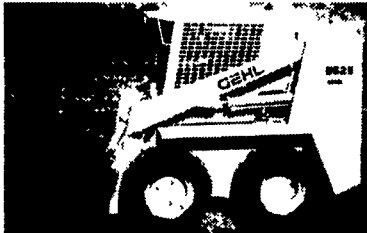
Gehl 6625 Skid Loader, cleaned & painted, good condition. . . $9,000