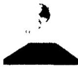
OEM Award from the Society of Automotive Engineers.

MF 6100 and MF 8100 Series Tractors have earned the two highest awards for uncompromising product innovation and technology.