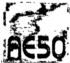
AE50 Award from the American Society of Agricultural Engineers

MF 6100 and MF 8100 Series Tractors have earned the two highest awards for uncompromising product innovation and technology.