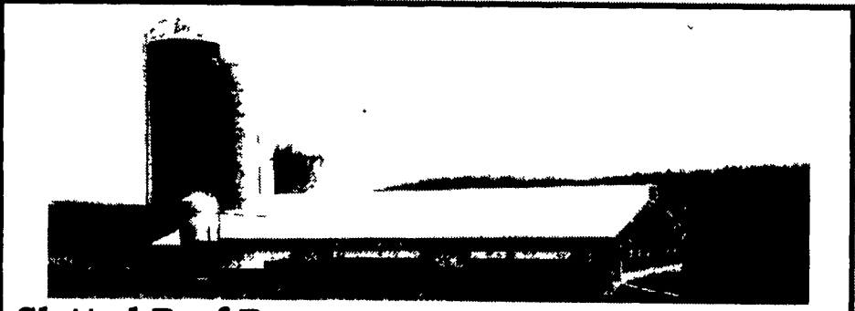
Slatted Beef Barn