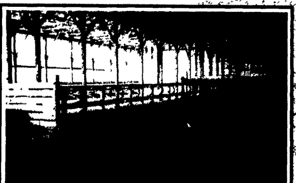
Slatted Free Stall Barn

Precast Concrete Bunker Silos or commodity buildings built to suit your needs. Bunkers available in 8 Ft. or 12 Ft. High