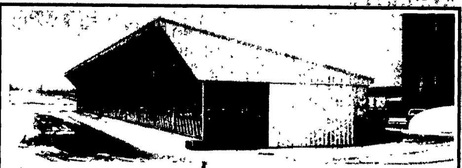
Slatted Heifer Barn