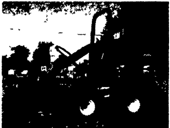
Kubota Model GF1800 Diesel Mower w/60" Deck, Grass Catcher, Only 390 Hrs. $6,500