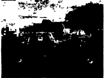
1994 Hustler Model 4600 Range Wing 1200 Hrs., Only 12 Ft. Cutting width $17,500