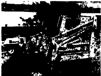
Hydra-Mac Model 4200 Commander A Little Machine That Does The Work of A Big Machine Just $10,995