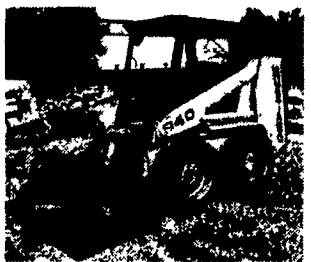
Mustang Model 940 Skid Loader VERY NICE! Only $9,995