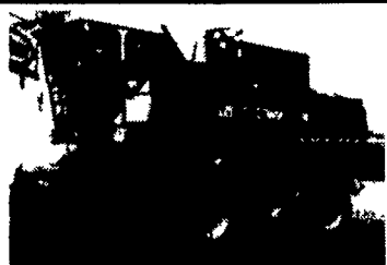
1990 MF 8460 Combine with Hillside Cleaning, 20 Ft Floating and 6 Row Corn Head, 2189 Hrs $67,000