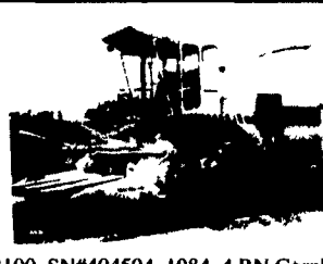
NH 2100, SN#404504, 1984, 4 RN Cornhead, 10' Hay Head, 4WD, 2500 Hrs, Like New, Rubber Excellent, One Owner $59,000

Like New - 20ft. MF 9650 Floating Grain Head to fit MF 860 & 760 Combine $9,700.00