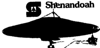
With 4' Canopy and 110-S Control