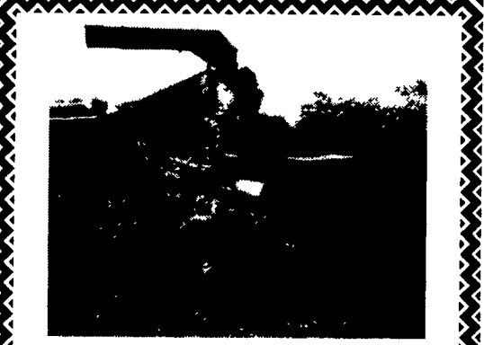
Bear Cat Roller Mill, Good Condition $2,200 717-738-1677