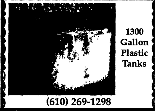
1300 Gallon Plastic Tanks