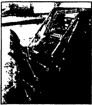
Easy Hookup to the front loader 5' to 10'