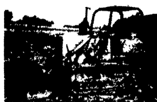
JD 555 Crawler Loader w/Ripper, Good U/C, Rebuilt Trans $14,000

Vernon E. Stup Co. 5859 Urbana Pike Frederick, Md. 21701 301-663-3185