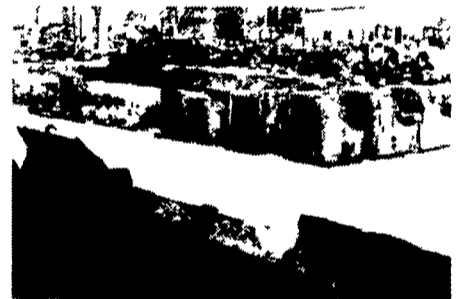
Large Inventory of Parts And Equipment