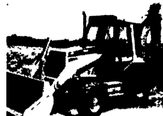
1993 Cat 416B 4x4, Ext-A-Hoe, EROPS, New Rubber $39,500