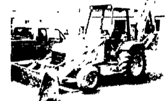
'93 Ford 555D TLB 2500 hrs, good rubber $24,500