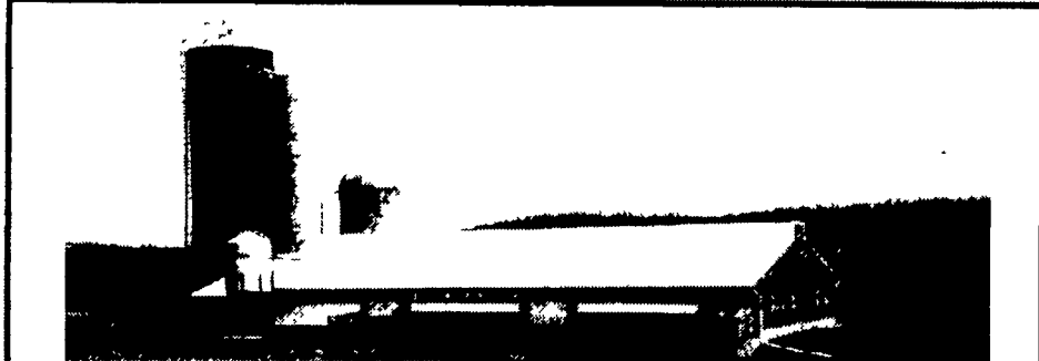
Slatted Beef Barn