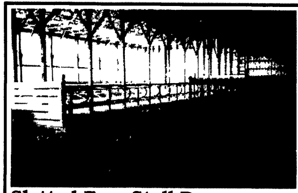
Slatted Free Stall Barn

Precast Concrete Bunker Silos or commodity buildings built to suit your needs. Bunkers available in 8 Ft. or 12 Ft. High