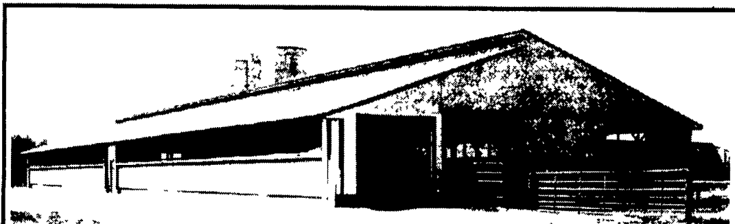
Concrete Slatted Free Stall Barn