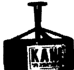
MODEL KSF STANDARD FEEDER 4"