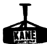
MODEL KSF-LP LOW PROFILE 2 1/2"