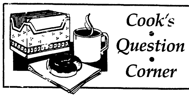
(Continued from Page B8)

QUESTION — Mrs. Jacob Novinger, Millersburg, is looking a canopy crochet pattern for a double bed. Send the pattern to her at 1439, Rt. 209, Millersburg, PA 17061.