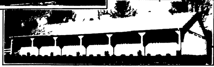
HORSE STALL BARN