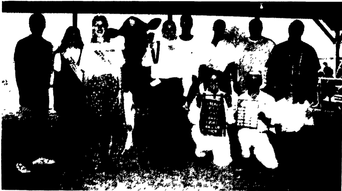
Delaware Valley College captured the premier breeder award at the Bucks County Holstein Show for the second straight year.