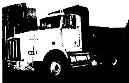
1991 Kenworth T800, 300 CT Eng, 9 speed 3.90 Ratio, Front Axle, 12,000 Lbs, Rear Axle 23,000 Lbs, Spring susps, 10 1/2 Dump Body