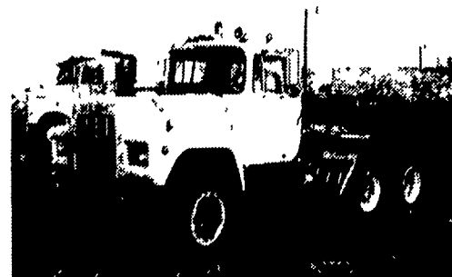
1988 Mack, 300 HP, Mack 5-Speed Camel Back