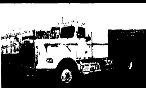
1987 Freightliner L10, 300 HP, 9-Speed, Front Axle 12,000 Lbs., Rear Axle 23,000 Lbs, Spring Suspension