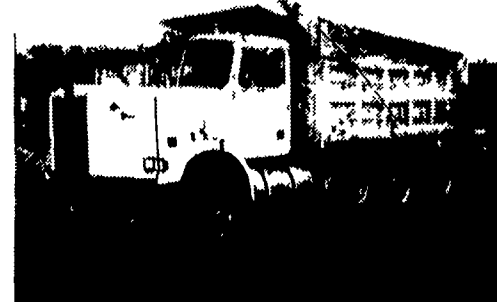
1987 Diamond REO, 300 Cu Eng, Front Axle 20,000 Lbs, Rear Axle 44,000 lbs, Henderson susps

Largest Stocking & Selling Extended Cab GMC Dealer in 7 States