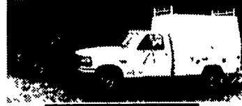
UTILITY WORK TRUCKS 93 FORD F350, V8, AT, A/C, 52K 94 DODGE 2500, V8, AT, A/C, 58K Call For Details