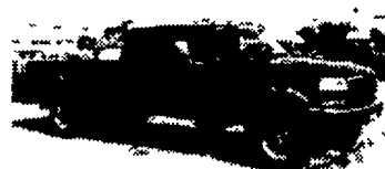
4 DOOR 4X4 XLT 97 FORD F350 Powerstroke Turbo Diesel, AT, A/C, Fully Loaded, 40/20/40 Seat, CD Player, Aluminum Wheels