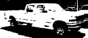
96 FORD F350 XLT 4X4 CREW CAB Looks Great, 15,000 Actual Miles, Powerstroke Turbo Diesel, AT, A/C, Limited Slip, 4 10 Gears