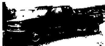
4X4 SUPER CAB DUALLY 97 CHEVY K3500 Super Great Towing Machine, High Output 6.5 Turbo Diesel, Auto, Limited Slip 4 10 Gear, Factory H.D. Trailer Pkg, Only 5,000 Miles, All New Truck Warranty