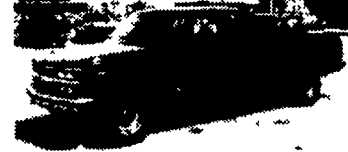
4X4 SUPER CAB 95 CHEVY SUPER CAB Heavy Duty 3/4 Ton, Cheyenne Pkg, Fuel Inj 350 V8-At, A/C, Vinyl Floor, 36,200 Miles