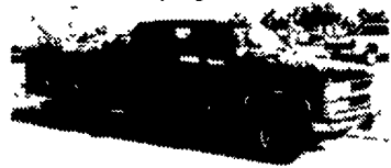
2 WHEEL DRIVE 95 CHEVY 2500 SUPER CAB Extra Clean, Extra Nice Only 37,000 Miles, 350 V8, AT, A/C, Tow Pkg. Positively The Cleanest Anywhere