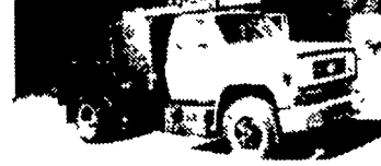
LIFT & LOAD 74 CHEVY WITH CRANE 21,000 GVW, 366 Gas Engine, 5 Sp Trans, 2 Sp Axle, Runs Very Well, only 51,000 miles $4,900