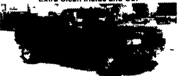
94 DODGE 3500 5 sp Diesel Dually 4X4, Hard To Find 4 10 Gears, A/C, Fact Tow Pkg, Very Nice