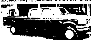
WORKING MAN'S CREW CAB FORD F350 XL 4 Wheel Drive, Powerstroke Turbo Diesel, HD, 5 Sp, A/C, 4 10 Gears, Big Swing Out Mirrors