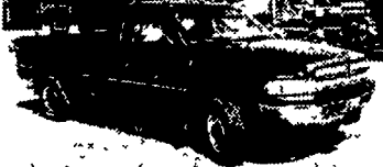
4x4 DODGE RAM 2500 Super Nice, Super Clean, 360 Magnum V8, Auto, A/C, Only 33,000 Miles $18,900