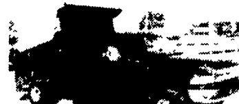
4X4 DUMP WITH TOOL BOXES 95 DODGE perfect for The Lannscaper, Cummins Turbo Diesel, AT, Only 34,000 Clean Miles