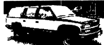
DIESEL SUBURBAN 94 CHEVY K2500 4X4 6.5 Turbo Diesel At Front & Rear, A/C, 3rd Seat, Barn Doors, Tow Pkg Super Nice 30,000 Miles