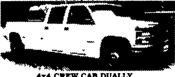
4x4 CREW CAB DUALLY 96 CHEVY K3500 SILVERADO Mint Condition, The Cleanest, 23,000 Miles, High Output, 6.5 Turbo Diesel, AT, A/C, Power Everything, CD Player