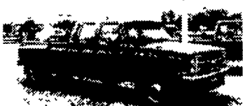
4x4 CREW CAB DUALLY 1988 Chevy K30, A nice one to own, only 41,000 original miles, 454-V8, A/C, all power equipment, tow package, chrome simulators