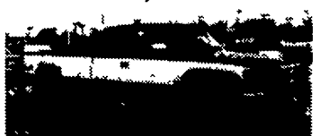
1 TON 4X4 99 CHEVY K3500 SILVERADO Made to Work, 1Ton Suspension, Strong 454 11 V-8, Auto, A/C, Tow Pkg, Extra Clean Inside and Out