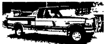
CENTURION CONVERSION 94 FORD F250 SUPER CAB 4x4 Beautiful, 7.3 Turbo Diesel, AT, A/C, Aluminum Wheels, 42,000 Miles, 4 10 Gears, Great Tow Machine