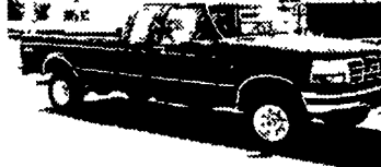
POWERSTROKE TURBO DIESEL FORD F250 SUPER CAB XLT 4 Wheel Drive, Only 1,500 Miles, Auto, A/C, Captain Chairs, Aluminum Wheels