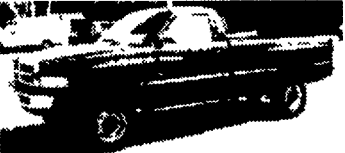
$23,900 96 DODGE WORK TK 4 Wheel Drive, H D 3/4 Ton Cummins Turbo, Diesel, AT, A/C, 4 10 Limited Slip Gears, Factory Tow Pkg, 34,000 Miles