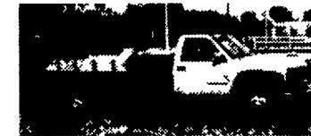
15,000 GVW 95 GMC 3500 H.D. FLATBED Like Brand New Only 810 Miles, High Output 6.5 Turbo Diesel Auto, A/C, 12 FT. Bed, Toolbox, 4-Wheel Disc Brakes, Awesome TK