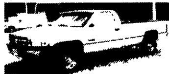
$23,900 BEAUTIFUL - LIKE NEW 95 DODGE 2500 SLT LARAMIE 4X4 Only 16,700 Miles, Heavy Duty 3/4 Ton, Cummins Turbo Diesel, AT, A/C, Tilt, Cruise, Pwr Locks & Windows, Chrome Wheels, Factory Tow Pkg