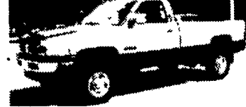
$24,900 96 DODGE 2500 4X4 Cummins Turbo Diesel, AT, A/C, Factory Tow Pkg, 26,000 Very Clean Miles