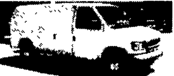
DIESEL CARGO VAN 97 FORD E350 Hard To Find, 1 Ton, Powerstroke Turbo Diesel, AT, A/C, Drivers Safety Screen, Tool Bins, It's Ready