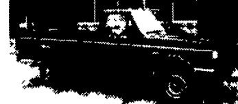
FARM TRUCK - WORK TRUCK 90 FORD F250 4X4 Heavy Duty 3/4 Ton, 7.3 Diesel, AT, A/C, Lock Out Hubs, Dual Tanks