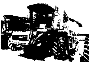
JD 9600 Combine 0 Hrs (#20880)