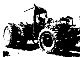
Case IH 7140 (#14450) 4365 Hrs $59,000