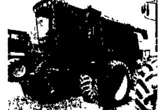
Case IH 1680 Combine (#11933) 2WD 2564 Hrs. $62,000