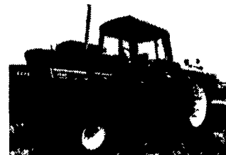
CIH 3688 (#13811) 3385 Hrs., 3 Pt Click Hitch $20,000