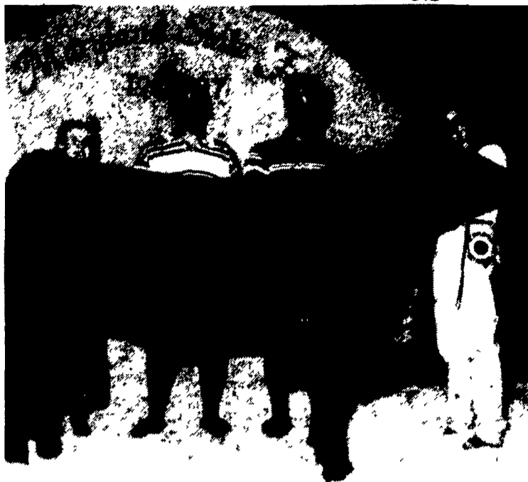
The grand champion market steer, exhibited by Jen Wildesen, was purchased by STOP Corporation.