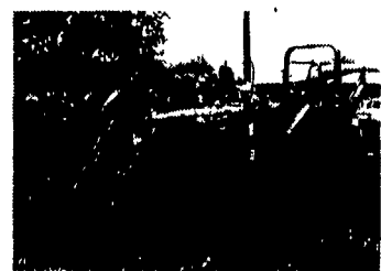
Kubota L3600 w/Loader 3 to Choose from