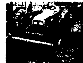
MF 1260 (LIKE NEW) w/Loader & Backhoe 312 Hrs BLOW-OUT AT $6,900