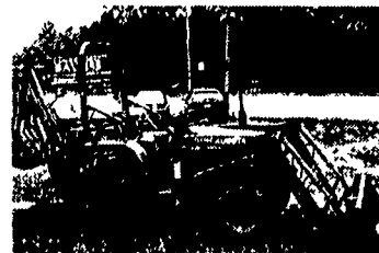
3 To Choose From Kubota B20 Tractor-Loader-Backhoe 357 Hrs., Excellent Cond