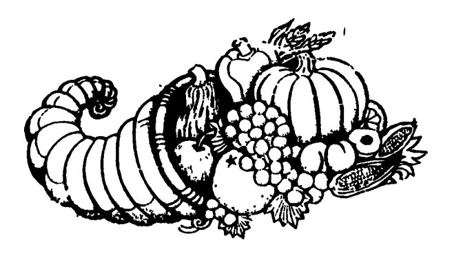
(Continued from Page B13)

Kelly plans to attend college, but hasn't selected a major.