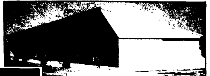
8 ft. Deep Pit with Waffle Slats & Rubber Dust Mattresses.

Heifer & Beef Barn Featuring Ventilated Curtains