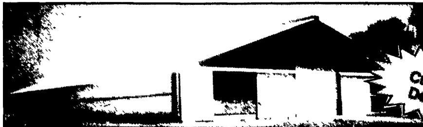
6 Row Freestall Barn

Heifer & Beef Barn Featuring Ventilated Curtains