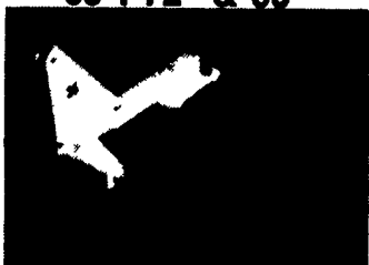
REAR BLADES 48" Through 120"