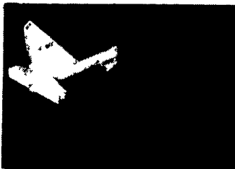
LANDSCAPE RAKES 48" Through 96"