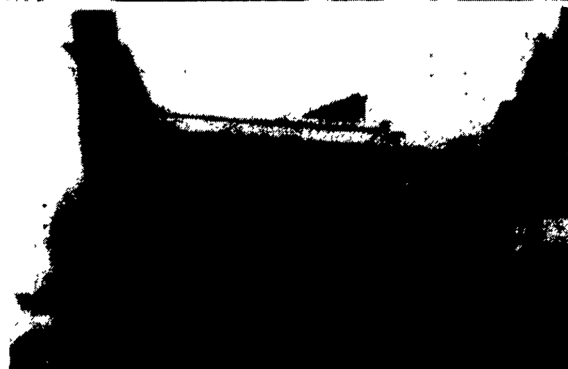
New Holland 892

Start Putting the Kernels from your corn silage in the milk tank instead of in the cow gutter!