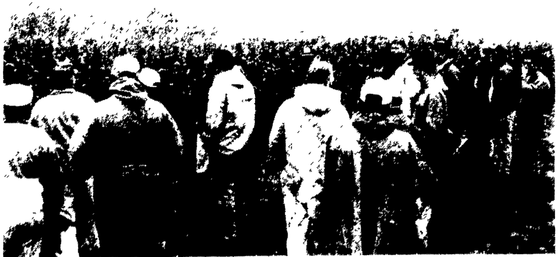
One plot showed the effects of using a preplant and starter fertilizer on corn. Others included large equipment inspections, a weed screen, a corn planting depth study, herbicide tests, and other items.

Grajewski showed nine different varieties of Roundup ready soybeans at the crop day, including five APK Agways and four