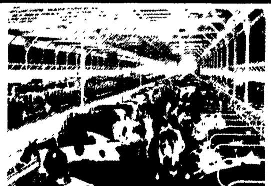
Free Stall Barn Interior