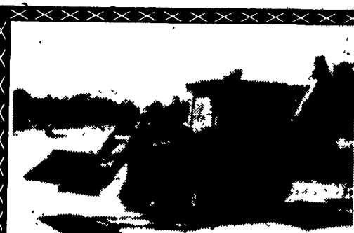
John Deere 410 wheel loader backhoe with cab $11,500

"Lancaster County's Best Fuel Injection Shop" Member of ADS 1030 Main Street (Rt. 23), Blue Ball, PA 17506-0426 • 717-354-2016