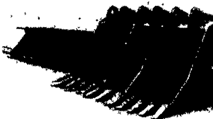
"Many Buckets To Choose From - Call For Pricing"