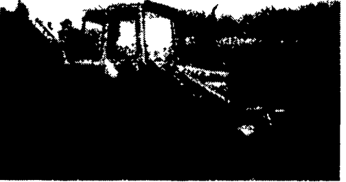
Ford 555B 4x4 Standard Hoe, 4-in-1 Bucket, Standard Bucket Available.....$17,500