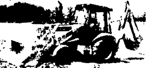
Case 580K 4x4, Ext -A-Hoe, New Paint, Nice Condition.....$26,900