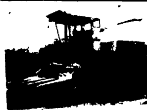
NH 2100, SN#404504, 1984, 4 RN Cornhead, 10' Hay Head, 4WD, 2500 Hrs, Like New, Rubber Excellent, One Owner $59,000